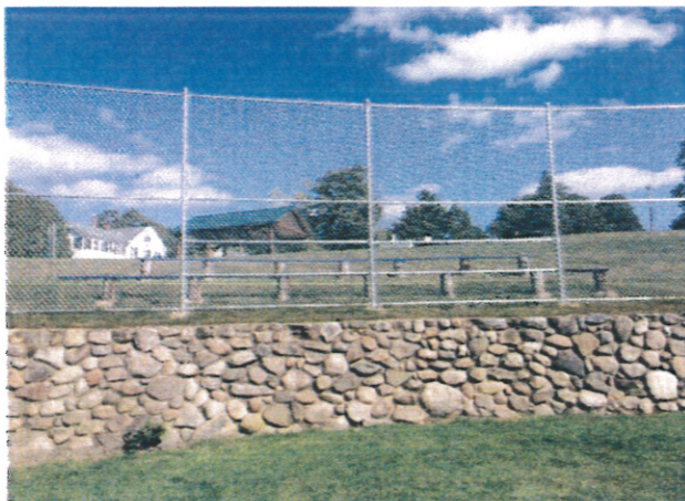
New Backstop- Summer 2014