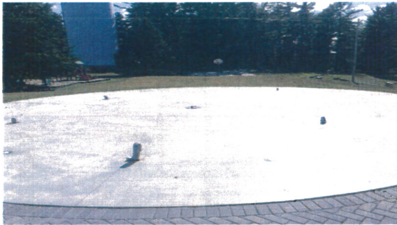
Splash Pad- winterized