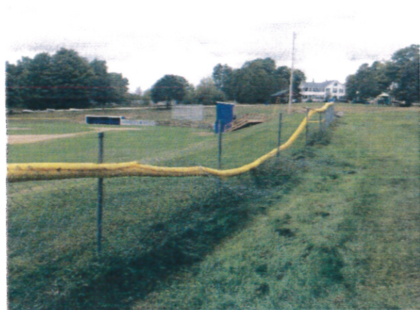
Fence that has been removed