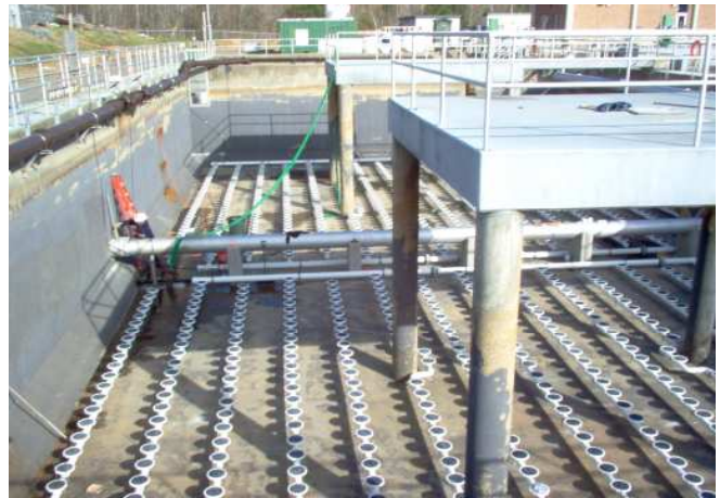
Fine Bubble Diffused Aeration

The heart of the process is the activated sludge Modified UCT process. A detailed description is provided on the next page. Included with the process are submersible mixers and pumps for anaerobic and anoxic zones and fine bubble diffuser aeration for improved oxygen transfer efficiency in the aeration zones.