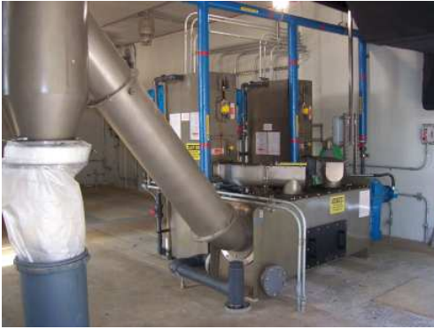
New 1/8 Inch Fine Screens Installed in Headworks Building

Underwood Engineers Inc. (UEI) of Portsmouth New Hampshire was selected to assist the City of Somersworth with evaluation, design and construction of improvements to the existing Somersworth WWTF to meet a total phosphorus limit of 0.5 mg/L, BOD 5 and TSS limit of 10 mg/L and NH 3 -N limit of 7 mg/L.