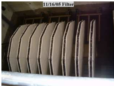
New Cloth Media Filters

Civil, and Environmental Engineering Portsmouth and Concord, NH