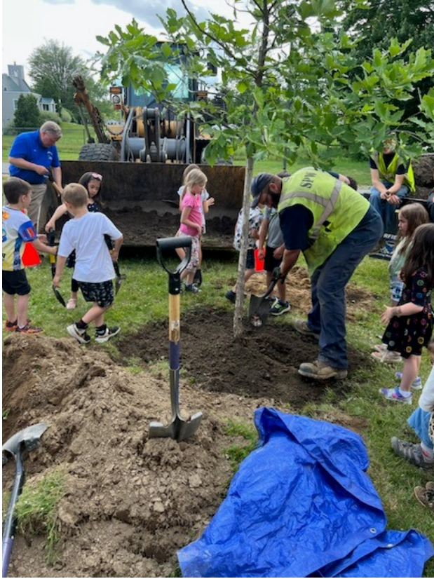
Public Works Highway crews assisted students and staff at Idlehurst Elementary for tree planting event. Tree were provided by a State Department of Natural Resources Canopy Grant.