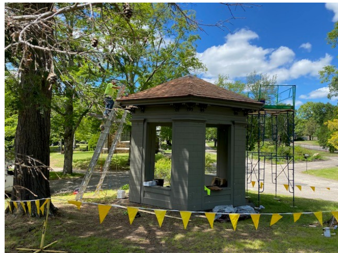
New cedar shingles being installed on the Italianate Wellhouse at Forest Glade Cemetery. The City received a State of NH Moose Plate Historic Preservation Grant for the funding, Weatherguard Industries is doing the roof installation.